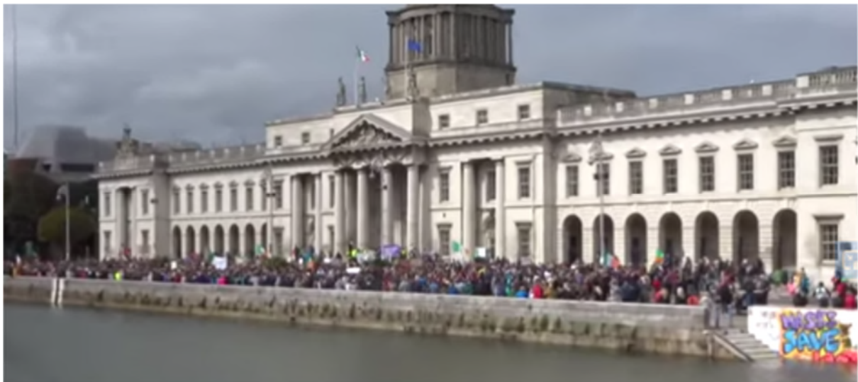
Large popular protest against government lies and lockdown restrictions on Custom House Quay, Dublin, on 22 August.

Many children who receive the nasal vaccine often experience flu-like side effects, including a fever, runny nose, cough, sore throat, muscle ache, headache, and fatigue. There is also a significantly increased risk of contracting a respiratory infection that is not flu-related. As one study stated: “We identified a statistically significant increased risk of noninfluenza respiratory virus infection among TIV recipients, including significant increases in the risk of rhinovirus and coxsackie/echovirus infection...” [emphasis added] [TIV means trivalent inactivated flu vaccine] - Increased Risk of Noninfluenza Respiratory Virus Infections Associated With Receipt of Inactivated Influenza Vaccine , B J Cowling etc, Clinical Infectious Diseases 2012:54, 15 June.